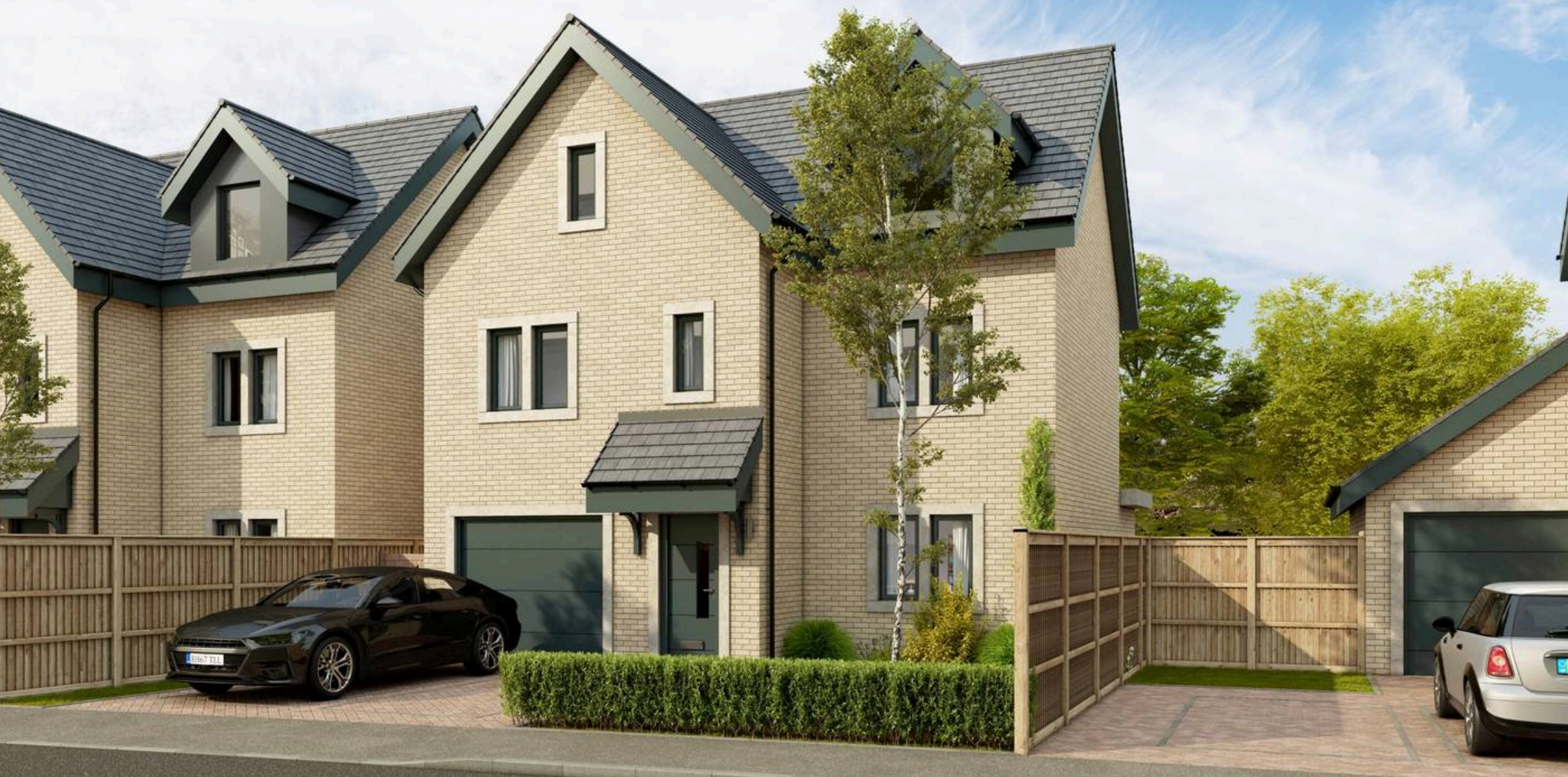
Plot 16, The Sycamore, Barley View, Roughbirchworth Lane, Oxspring Sheffield