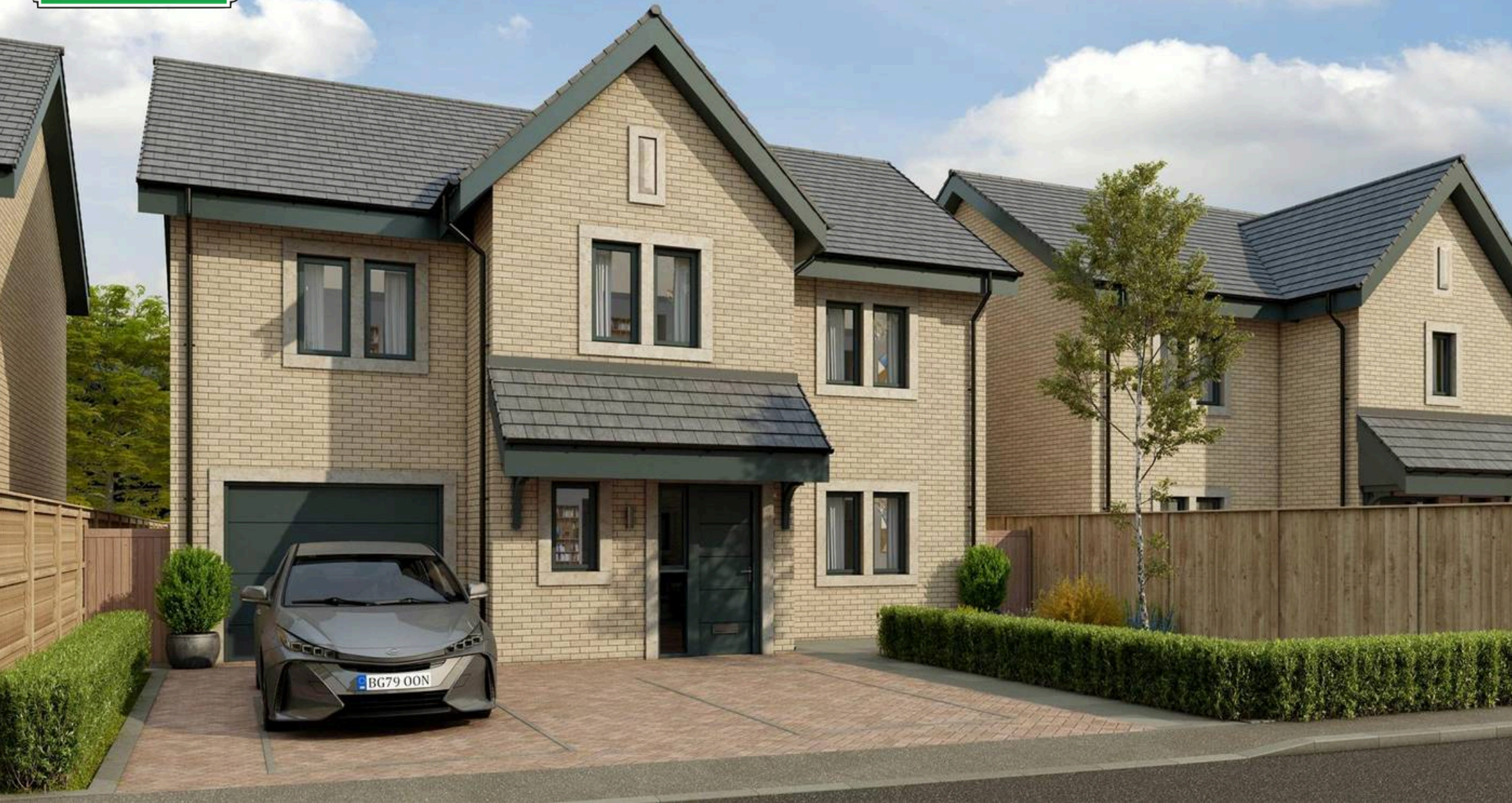
Plot 22, The Birch, Barley View, Roughbirchworth Lane, Oxspring Sheffield