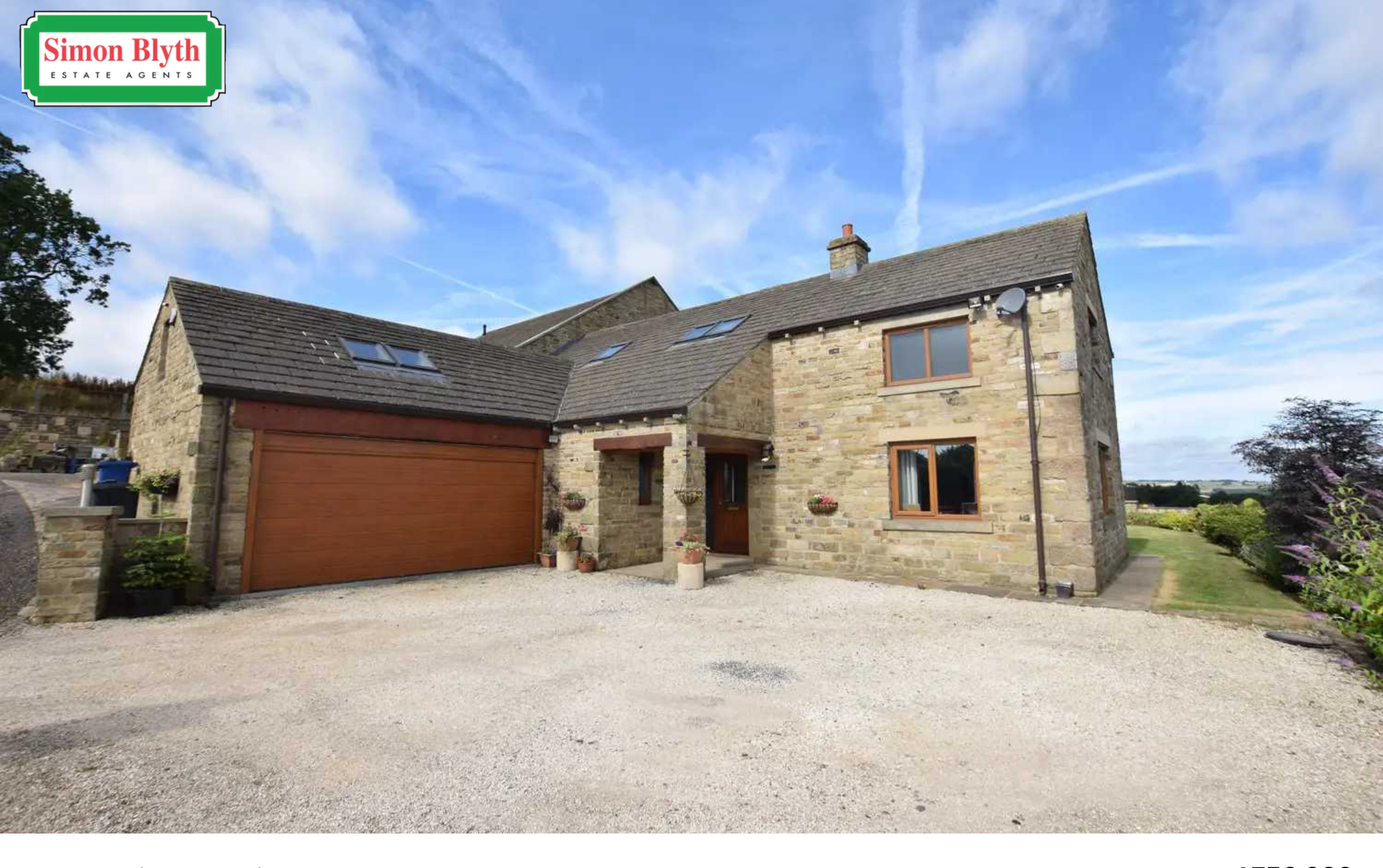
The Spires, Haigh Head Road Sheffield