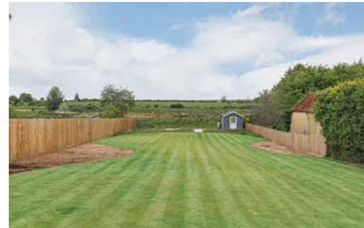
The Garden and Views at Sheldrake

“From all aspects of this thoughtfully designed home, you can take in beautiful Norfolk views.”