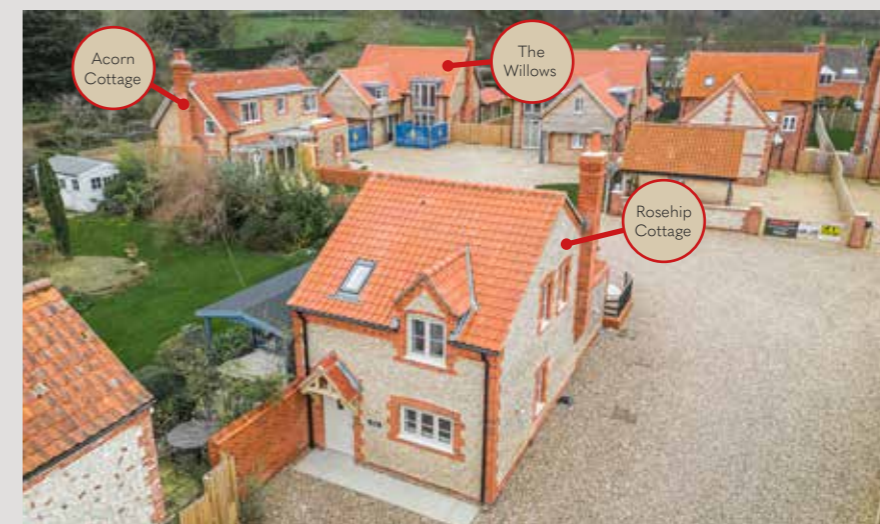
Three beautiful, individual homes at The Quavers.