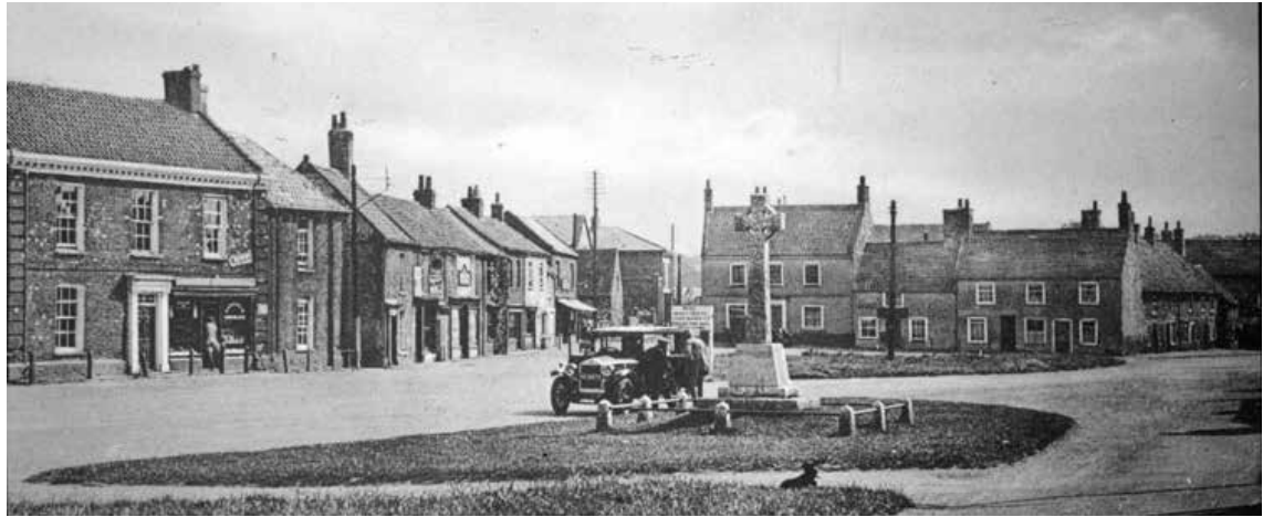
A historic photograph of Burnham Market.