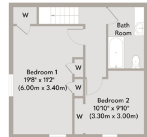
First Floor Approximate Floor Area 400 sq. ft (37.20 sq. m)

Whilst every attempt has been made to ensure the accuracy of the floor plan contained here, measurements of doors, windows, rooms and any other items are approximate and no responsibility is taken for any error, omission, or mis-statement. This plan is for illustrative purposes only and should be used as such by any prospective purchaser or tenant. The services, systems and appliances shown have not been tested and no guarantee as to their operability or efficiency can be given.