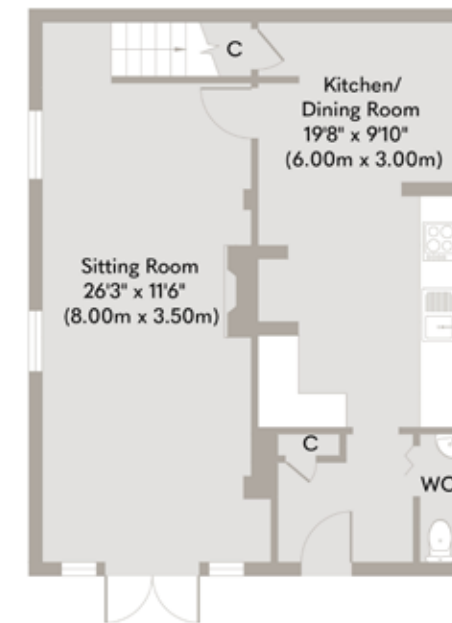
Ground Floor Approximate Floor Area 534 sq. ft (49.60 sq. m)