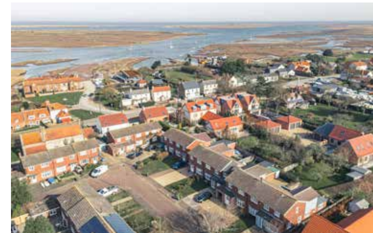
31 The Close

“We love the close proximity to the sea and wonderful coastal walks. This has been a treasured holiday home.”