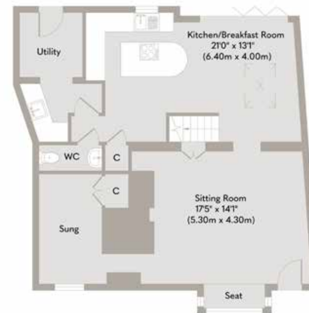
Ground Floor Approximate Floor Area 760 sq. ft (70.63 sq. m)