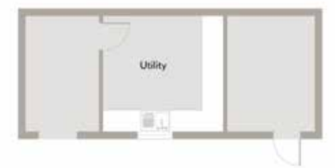
Annexe Approximate Floor Area 276 sq. ft (25.60 sq. m)

Whilst every attempt has been made to ensure the accuracy of the floor plan contained here, measurements of doors, windows, rooms and any other items are approximate and no responsibility is taken for any error, omission, or mis-statement. This plan is for illustrative purposes only and should be used as such by any prospective purchaser or tenant. The services, systems and appliances shown have not been tested and no guarantee as to their operability or efficiency can be given.