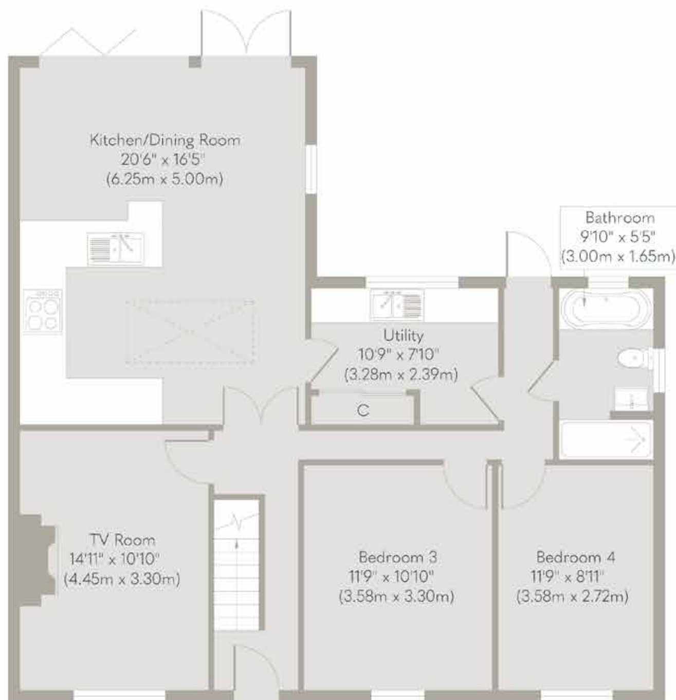
Ground Floor Approximate Floor Area 1,049 sq. ft (97.41 sq. m)