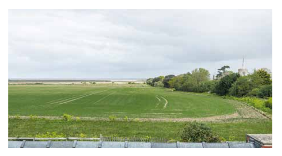
Looking over fields towards the coast, to the rear of 2 Main Road

"...here you look out across the RSPB nature reserve directly onto the coastline where the tide rolls in over pristine sand." SOWERBYS