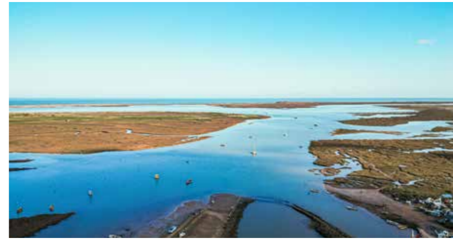
View over The Staithe

“We love life at The Staithe - it’s wonderful for sailing, paddleboarding and socialising.”