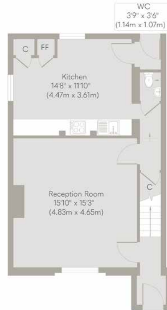
Ground Floor Approximate Floor Area 524 sq. ft (48.68 sq. m)