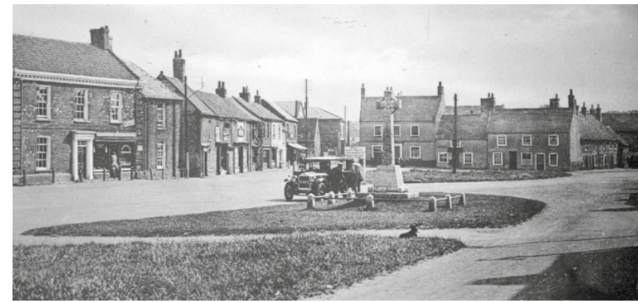
Historic photo of The Green, Burnham Market