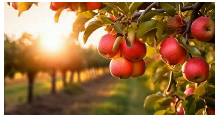
The Walled Garden was originally created to provide year round produce for the occupants of Burnham Westgate Hall.

“...the garden will not only pay homage to its historical significance, but at the same time will provide a practical and aesthetic use of this wonderful open space.”