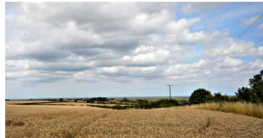
View from Herrings Lane towards Burnham Norton

“We’ve greatly enjoyed the stunning beaches and the variety of walks...”