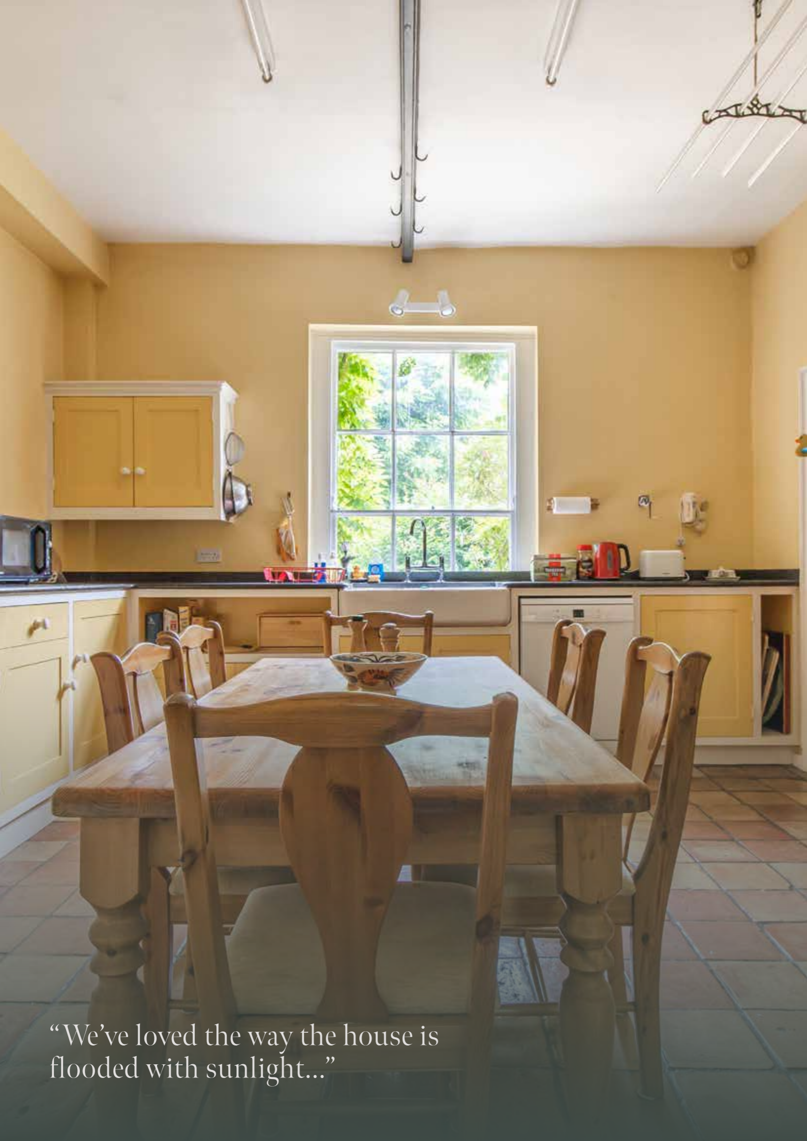
“We’ve loved the way the house is flooded with sunlight...”