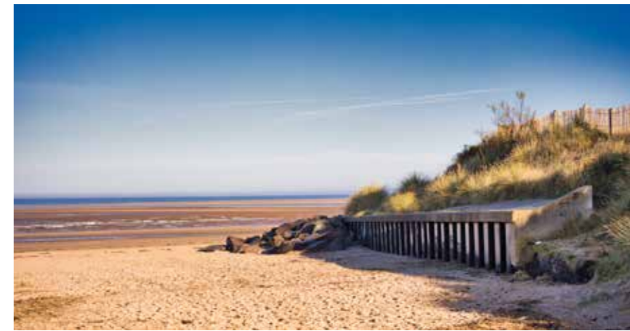
Sea Views at Near By Brancaster

“Contemporary and stylish living spaces, within your brand new home”