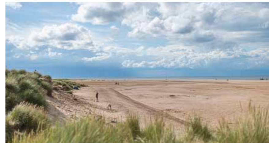
Views of near by Brancaster Beach.

““Comfortable and stylish living spaces that are socially conscious.””