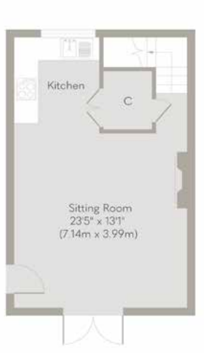
Ground Floor Approximate Floor Area 336 sq. ft (31.21 sq. m)

Whilst every attempt has been made to ensure the accuracy of the floor plan contained here, measurements of doors, windows, rooms and any other items are approximate and no responsibility is taken for any error, omission, or mis-statement. This plan is for illustrative purposes only and should be used as such by any prospective purchaser or tenant. The services, systems and appliances shown have not been tested and no guarantee as to their operability or efficiency can be given.