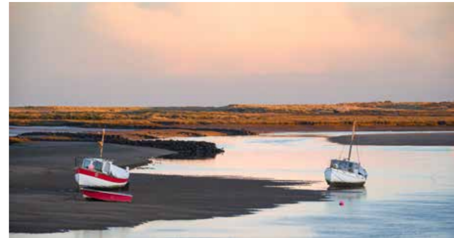
Burnham Overy Staithe

“The local area is naturally beautiful. We especially love to visit Burnham Overy Staithe and Stiffkey Marshes.”