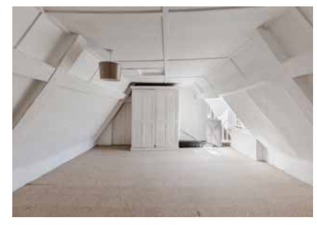
A charming Grade II listed farmhouse in the heart of the North Norfolk Countryside.