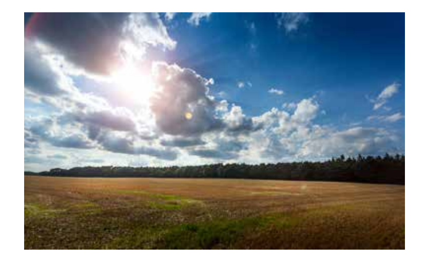
North Norfolk Countryside

"We've loved the beauty of the area, birds singing, lots of wildlife all visible. There are lots of lovely walks with beautiful views."