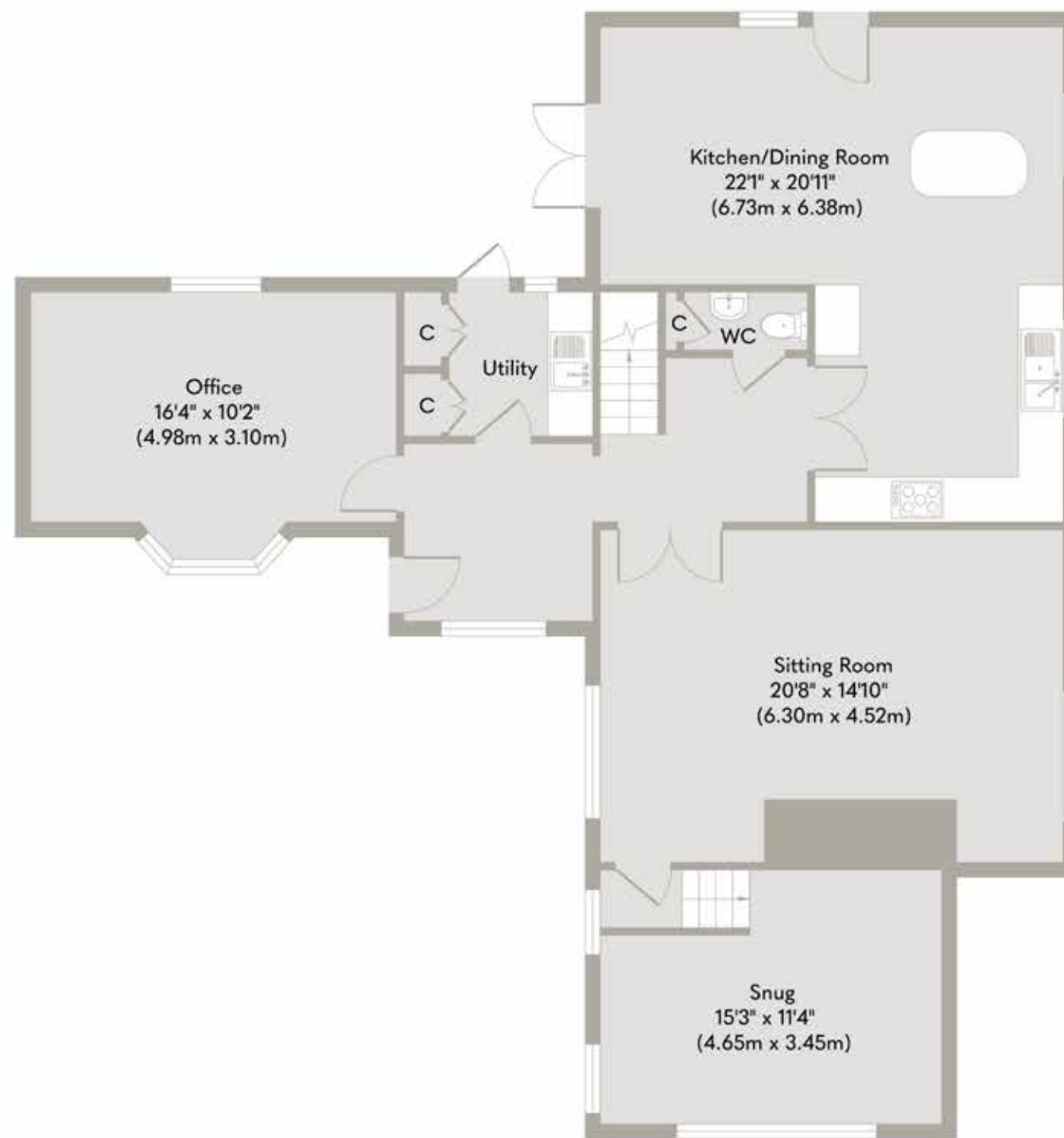
Ground Floor Approximate Floor Area 1,255 sq. ft (116.62 sq. m)