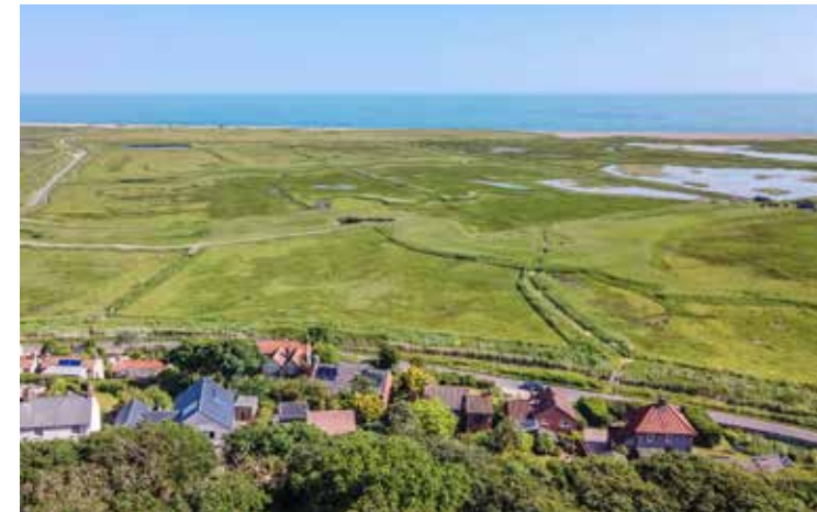
Coastal marshes at Cley

“...comfort and practicality, surrounded by the natural beauty of the North Norfolk coastline.”