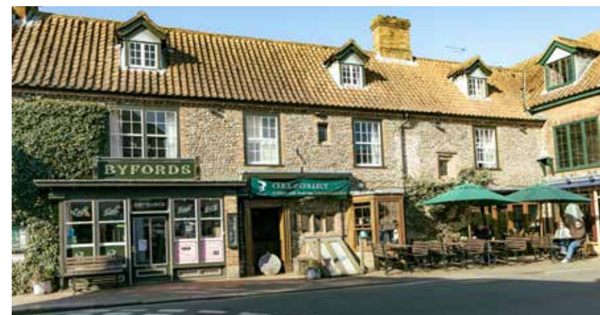
Byfords deli and café.

"Holt High Street is going from strength to strength."