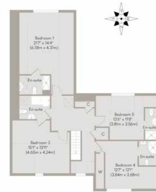
First Floor Approximate Floor Area 1,141 sq. ft (105.98 sq. m)