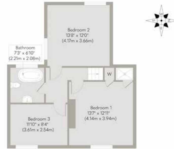
First Floor Approximate Floor Area 577 sq. ft (53.57 sq. m)