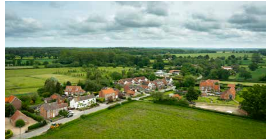
Aerial view of The Old Chequers and surrounding area

“We’ve never lived in such a friendly village before, and there are so many beautiful walks from the door.”