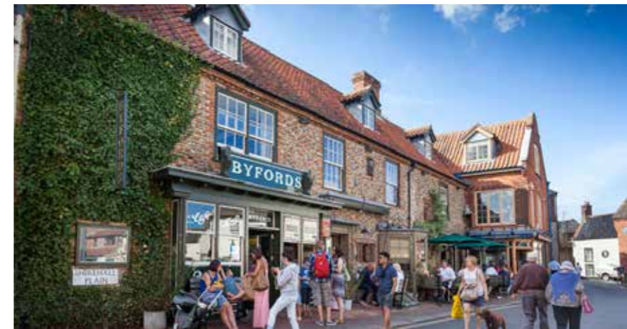
Byfords Restaurant and Cafe.

“We have loved being in the middle of Holt for all the shops and pubs, but still an easy distance to the coast.”