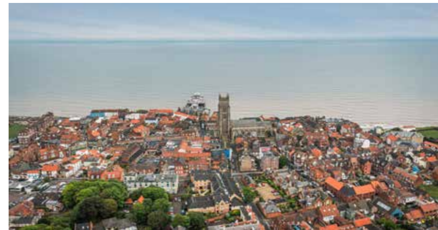
Aerial view of Cromer

"We're close to the sea, but also in a tranquil spot, away from the bustling town."