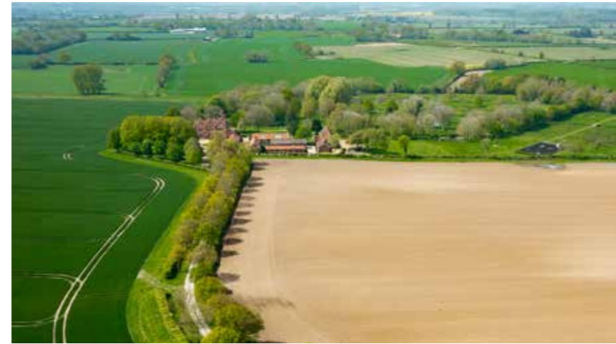
Wood Dalling Hall and grounds that surround.

“Lush greenery and tranquil surroundings create an idyllic backdrop...”