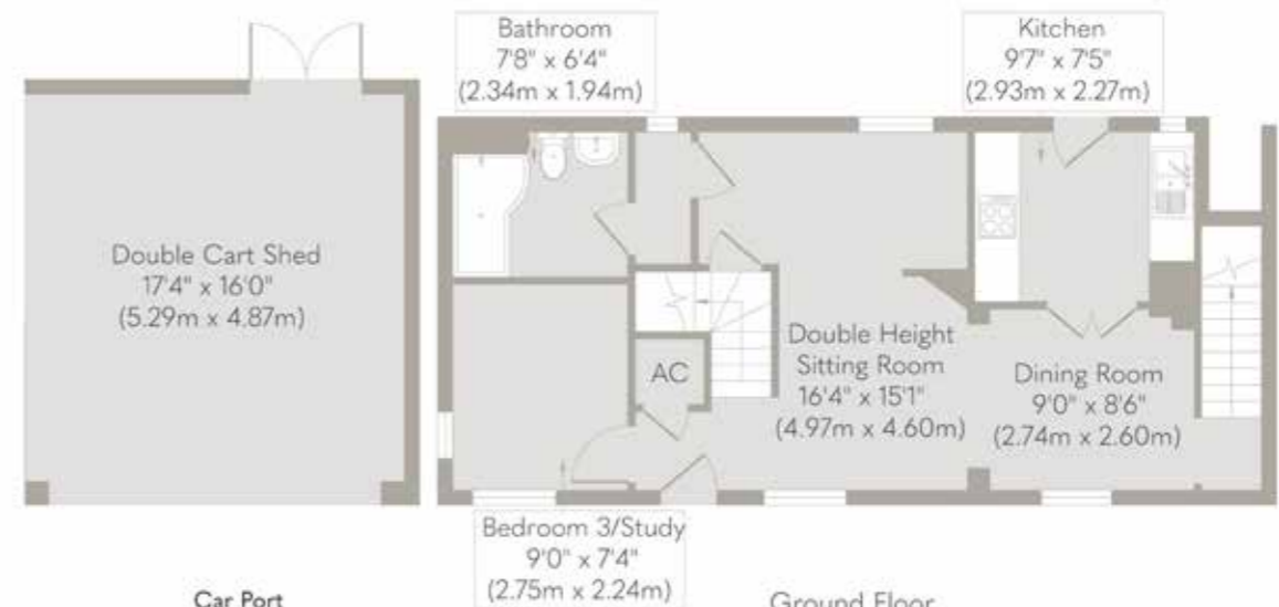
Car Port Approximate Floor Area 277 sq. ft (25.76 sq. m)