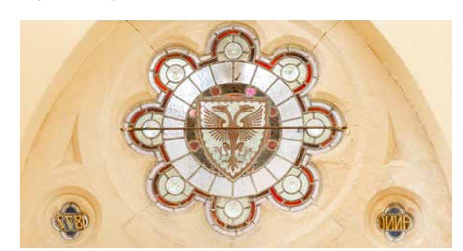
Hoare family crest

"The building holds an incredibly fascinating past."