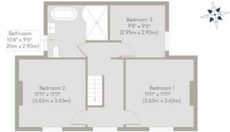
First Floor Approximate Floor Area 560 sq. ft (52.02 sq. m)