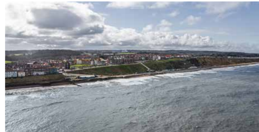
A picture of Cromer, a coast 20 minutes away from Holt.

“We’ve loved the seamless connection with the countryside, the coast and a life with the practical necessities not far away.”