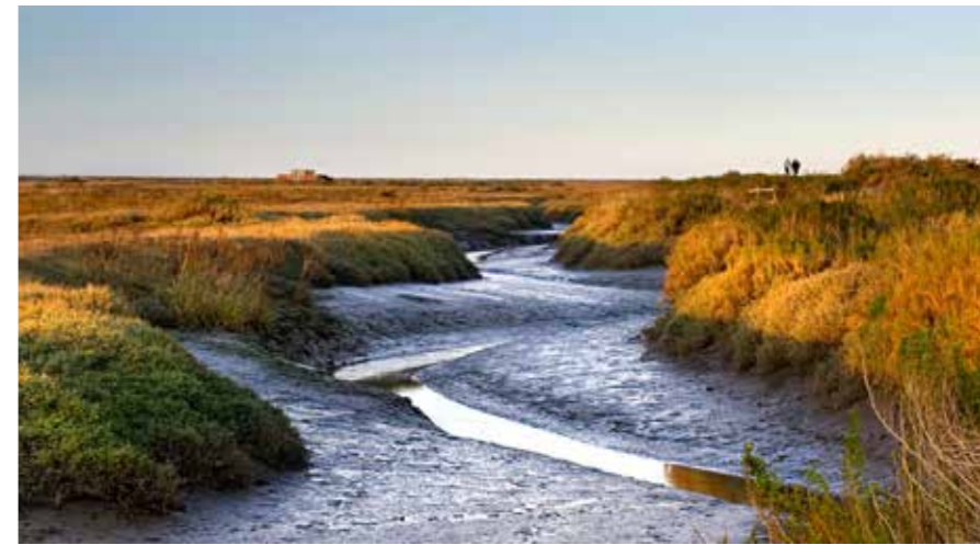
Located in an Area of Outstanding Beauty, Blakeney is well worth a visit.

“Located with a famous town, you're still only 10 minutes away from an equally renowned coastline.”