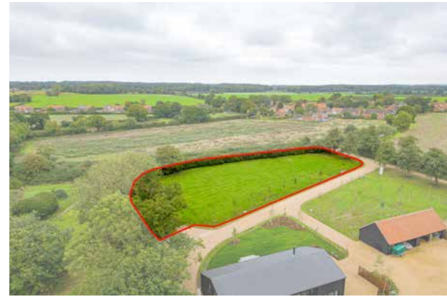
Amenity Land available separately.