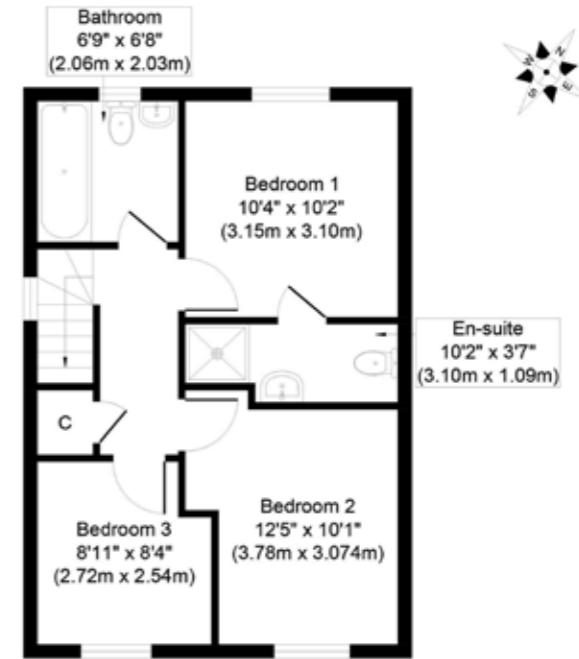
First Floor Approximate Floor Area 449 sq. ft (41.71 sq. m)