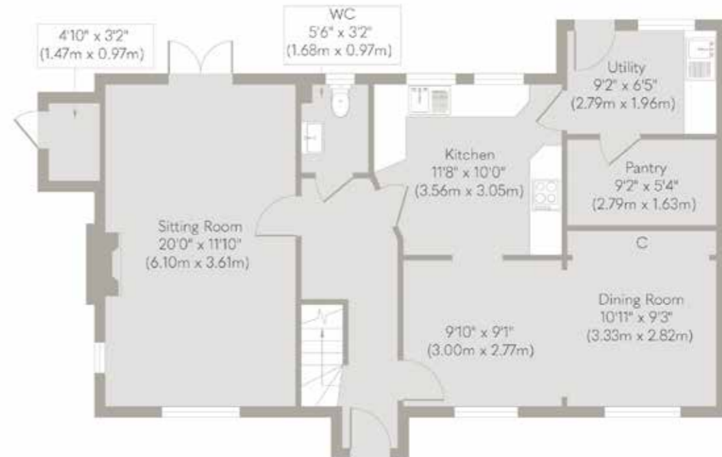
Ground Floor Approximate Floor Area 815 sq. ft (75.71 sq. m)