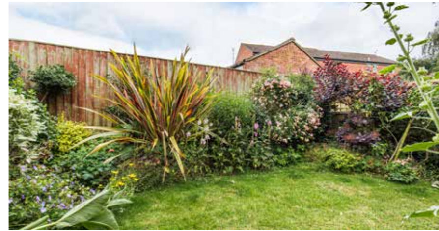
7 The Beeches garden.

“A lovely private enclosed garden that has a wide selection of blossoms and shrubbery.”