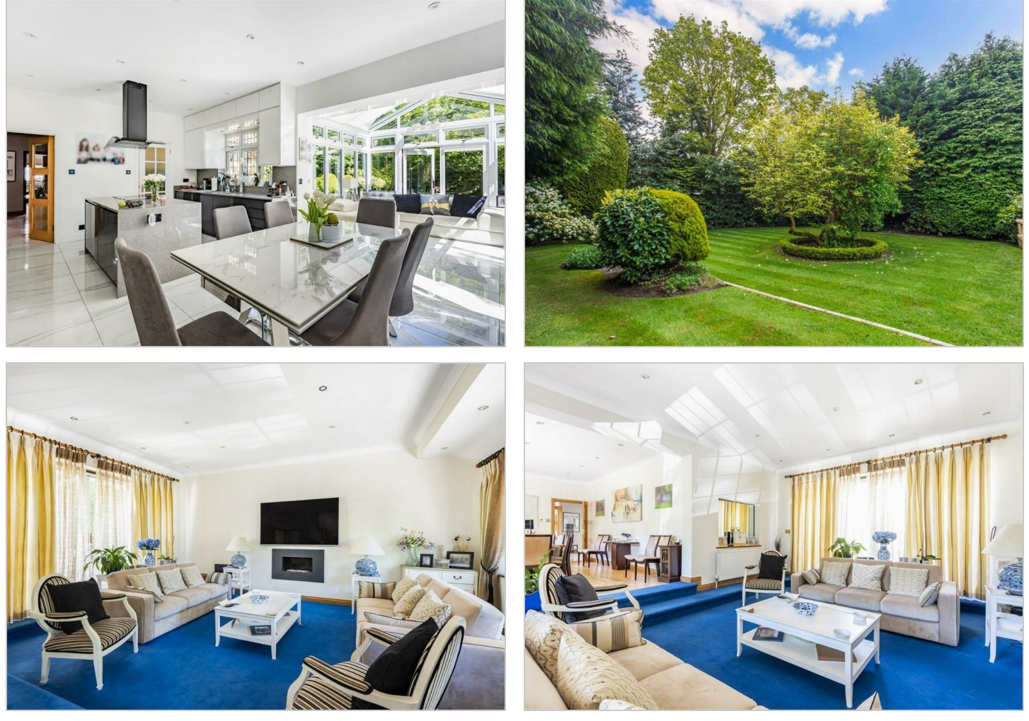
These particulars, whilst believed to be accurate are set out as a general outline only for guidance and do not constitute any part of an offer or contract. Intending purchasers should not rely on them as statements of representation of fact, but must satisfy themselves by inspection or otherwise as to their accuracy. No person in this firms employment has the authority to make or give any representation or warranty in respect of the property.