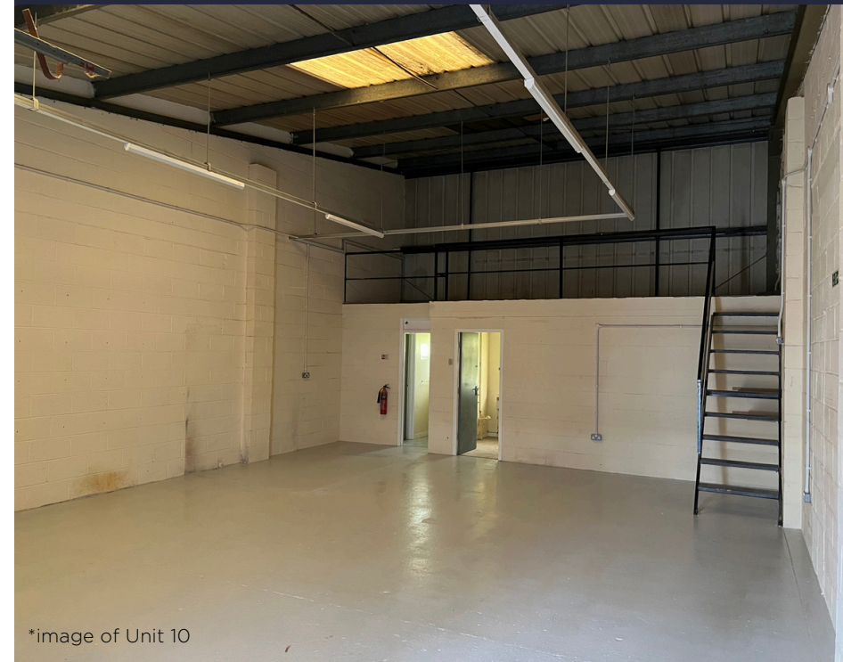
*image of Unit 10

We understand the properties benefit from gas, water and electric connection.