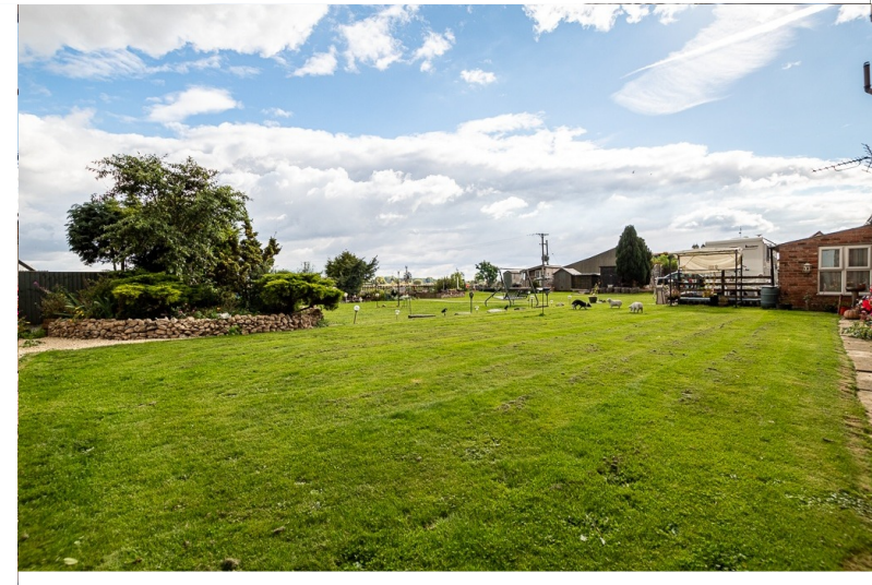
Offers in the region of £550,000