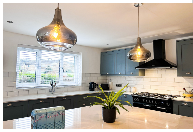
Asking Price £390,000