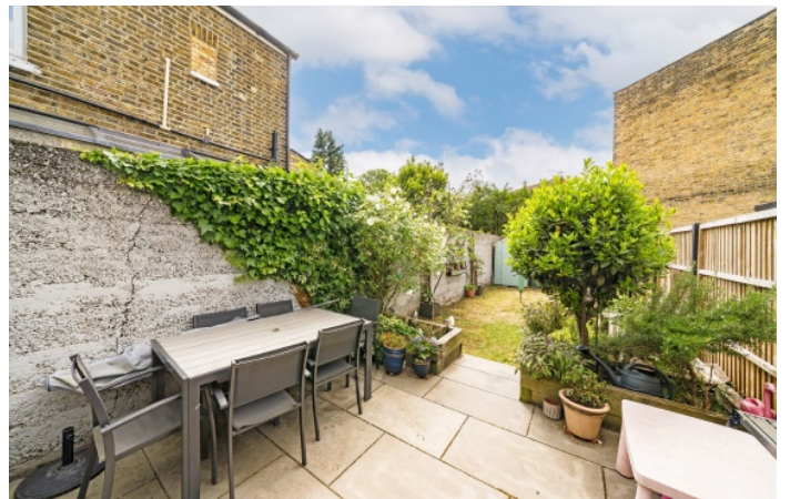
Walpole Road, SW19