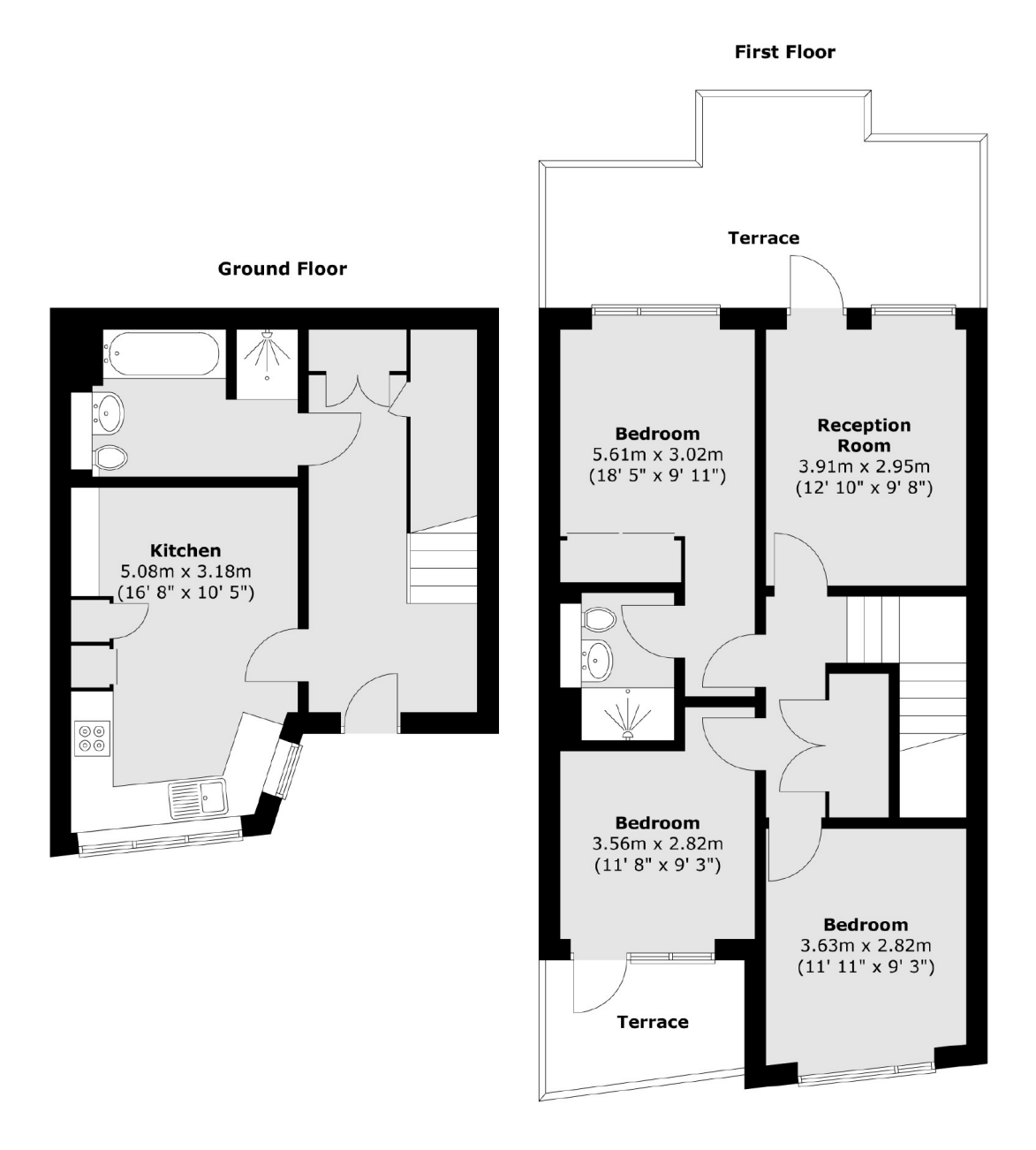
Total area (approx.) : 95.5 sq. m (1028 sq. ft) Total terrace area (approx.) : 20.3 sq. m (219 sq. ft)