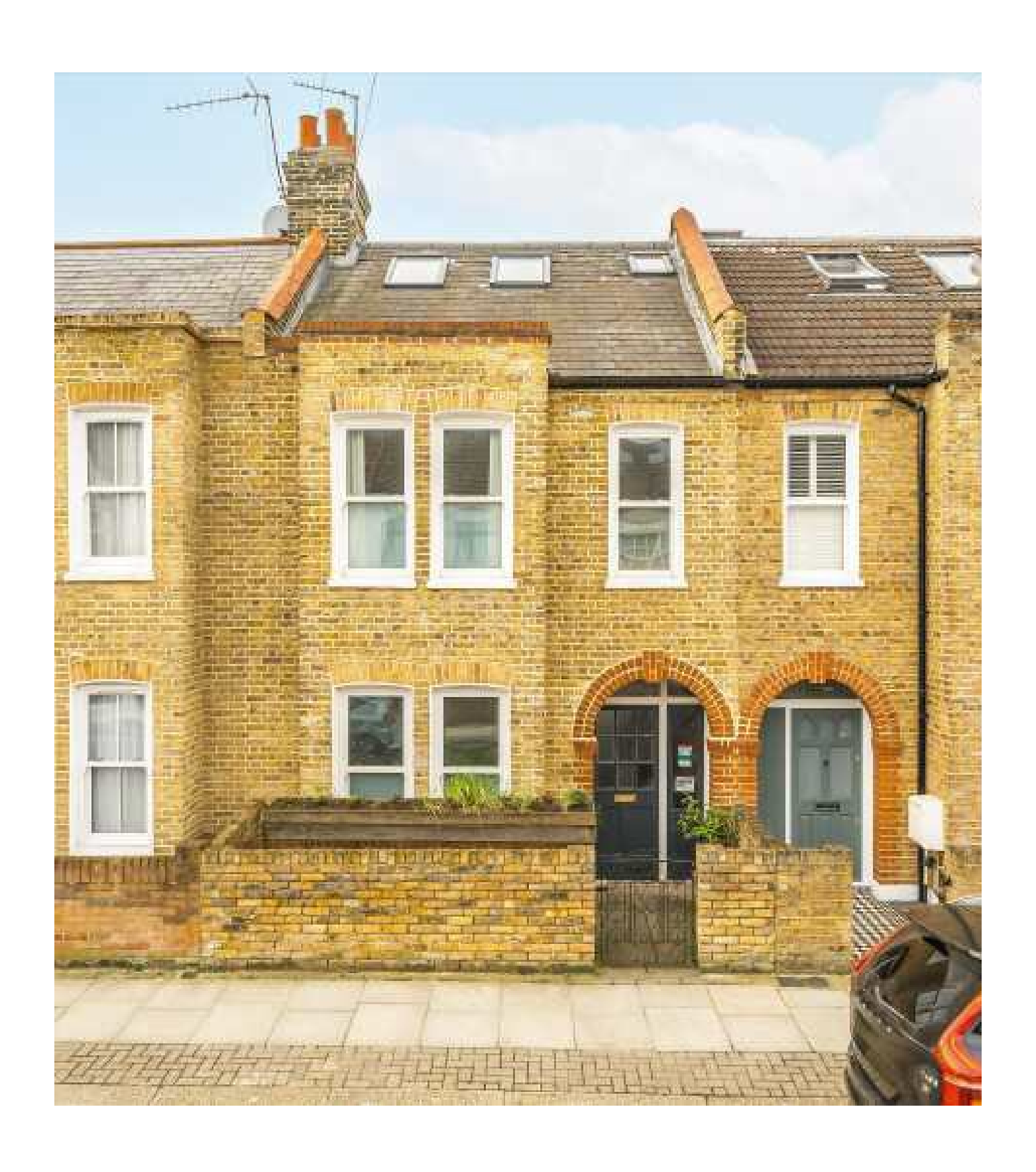
Gatton Road, SW17 £1,000,000