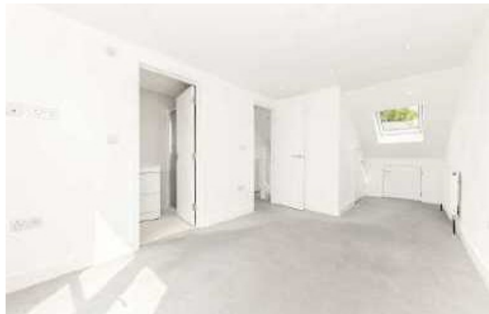
Blackshaw Road, SW17