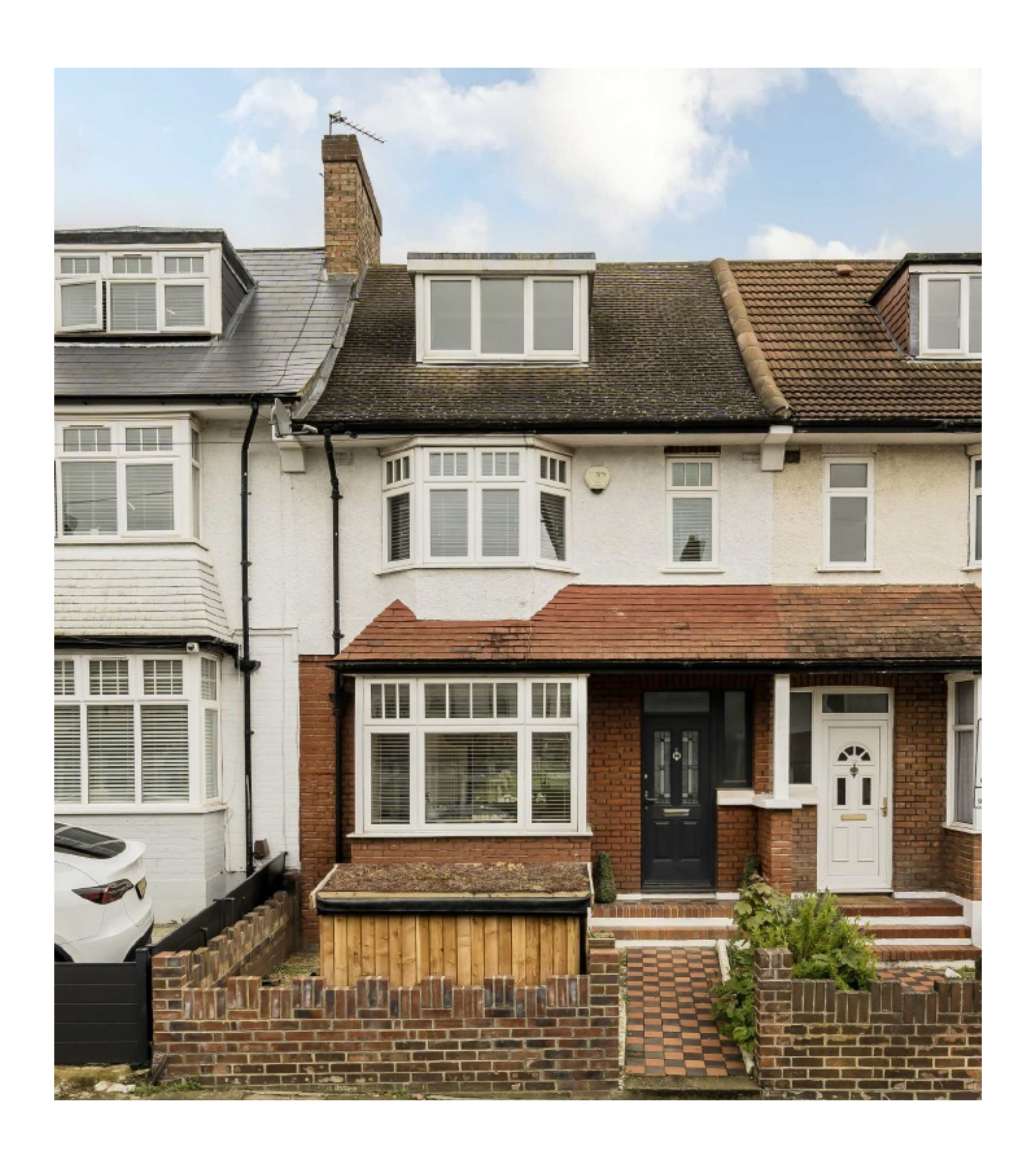
Hebdon Road, SW17 £1,000,000