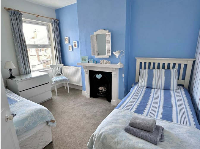
Bedroom 3 12'7" x 9'4" (3.84m x 2.84m)

Feature fireplace. Radiator. uPVC double glazed window to rear.