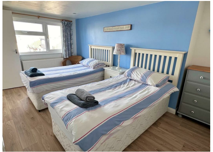
Bedroom 1 15'0" x 8'3" excluding recess (4.57m x 2.51m excluding recess)

Eaves storage. Radiator. Inset ceiling spotlights. uPVC double glazed window to rear. Door to: