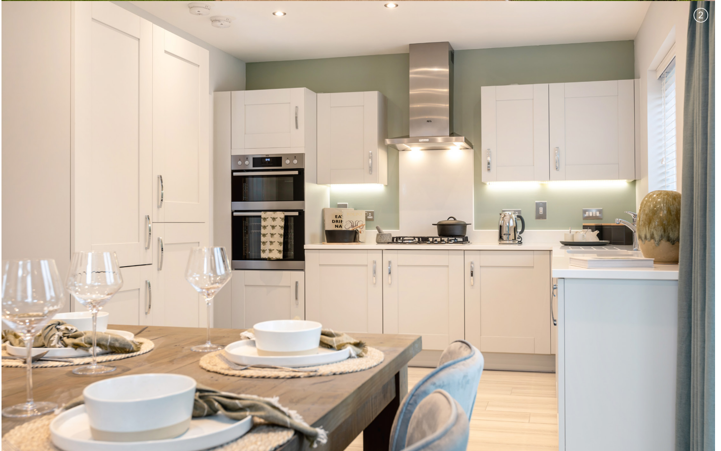
① ↪ Street Scene at Bluebell Green ② ↪ Typical Interior