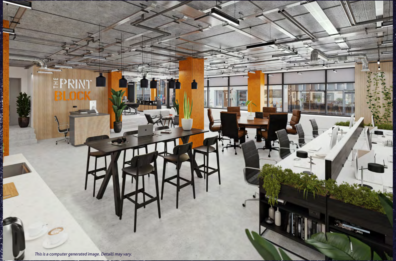
This is a computer generated image. Details may vary.

Everards is under construction and will complete in Q4 2021. It is a rare opportunity to acquire a self-contained building in the heart of the city on either a freehold or leasehold basis. The building will be completed to shell and floor condition allowing an incoming tenant the opportunity to impact upon the design of the finished product. Forming part of the wider 255 bed hotel development completing at the same time, the building will benefit from prominent access, raised floor and plenty of occupier amenity including 8 bike racks. What's more the adjacent Dalata hotel will offer a bar, restaurant, gym, café and conference centre.