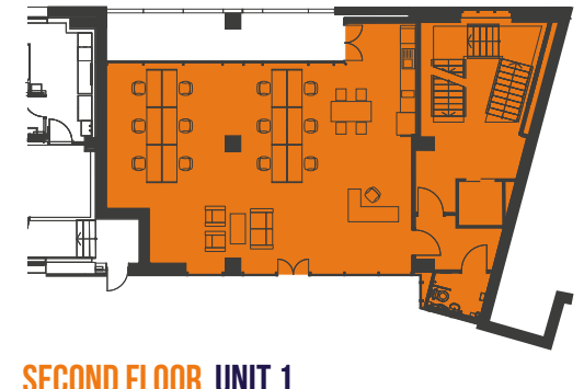
SECOND FLOOR UNIT 1